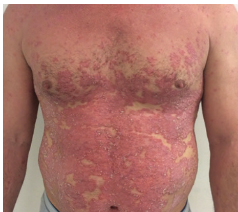
FIGURA 1. Placche eritemato-squamose di psoriasi localizzate a livello del torace e addome in un paziente di 55 anni.