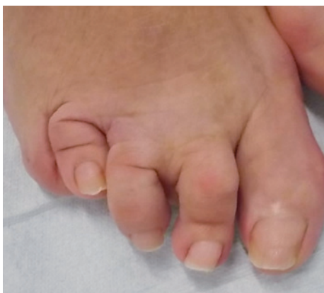
FIGURA 2. Artrite psoriasica delle articolazioni interfalangee del piede con fenomeni di accorciamento "a cannocchiale" del III e IV dito del piede.