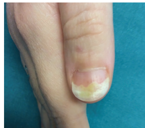
FIGURA 3. Onicolisi psoriasica del I dito della mano in una paziente di 19 anni. La porzione distale della lamina è parzialmente sollevata dal letto ungueale.

nata, la vitamina D promuove la produzione da parte dei macrofagi e cellule epiteliali di peptidi antimicrobici quali defensine e cateelicidine inclusa la hCAP18/LL-37 e nei macrofagi l'espressione di Toll Like Receptor 2 e CD14 5 . I peptidi antimicrobici esercitano la loro azione microbica formando dei pori destruenti sulla membrana batterica e inibendo l'attività enzimatica, mitocondriale e la sintesi degli acidi nucleici e delle proteine batteriche. Inoltre, il legame tra la vitamina D e il suo recettore stimola il meccanismo dell'autofagia mediante la produzione di LL-37 che media la fusione del fagolisosoma con il lisosoma. L'autofagia serve a rimuovere proteine o organuli danneggiati ed esercita un'azione microbica contro patogeni intracellulari 6 .